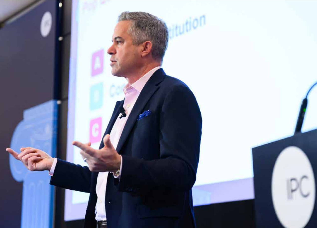
By fostering a highly interconnected community, IPC enables efficient trade execution and seamless access to global liquidity venues

Millions of voice quotes are generated every day over IPC’s communications platform. What work have you been doing to drive further innovation in the voice trading space, for example by unlocking this market data and digitising voice communications to provide valuable insights?