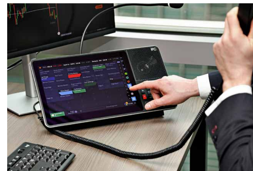
OneView unifies everything that needs to be 'attached' to a voice trade within a single touch, single view environment

We're investing heavily to ensure our clients can operate efficiently in this new, more dynamic market environment.