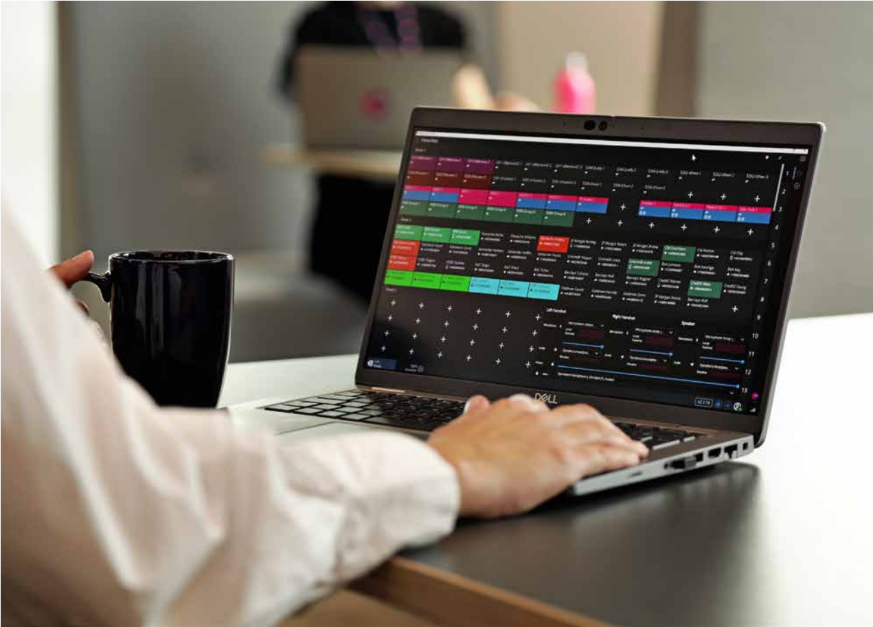
IPC’s ecosystem ensures that financial firms of all sizes can operate efficiently and competitively.

By integrating AI with voice communications, IPC will continue to enhance not just voice trading, but